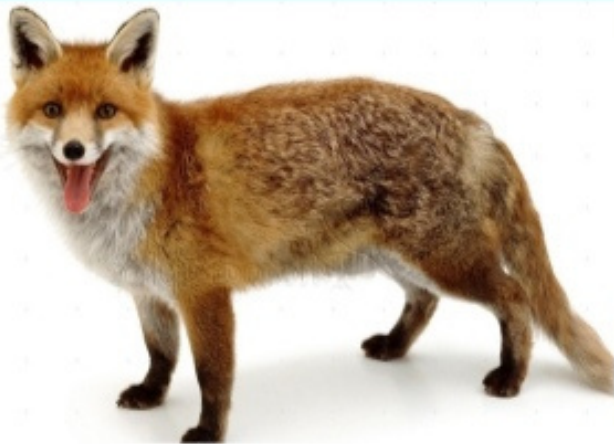
f o x