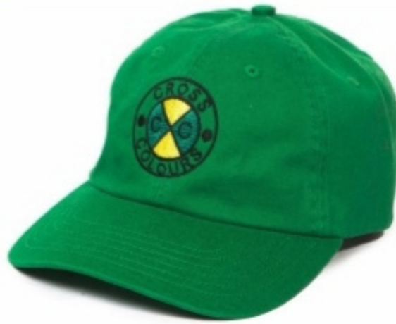
c a p