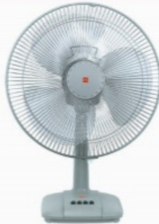
f a n