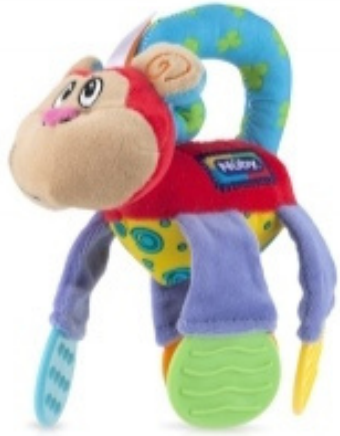
t o y