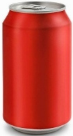
c a n