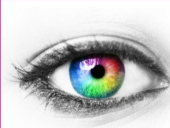
e y e