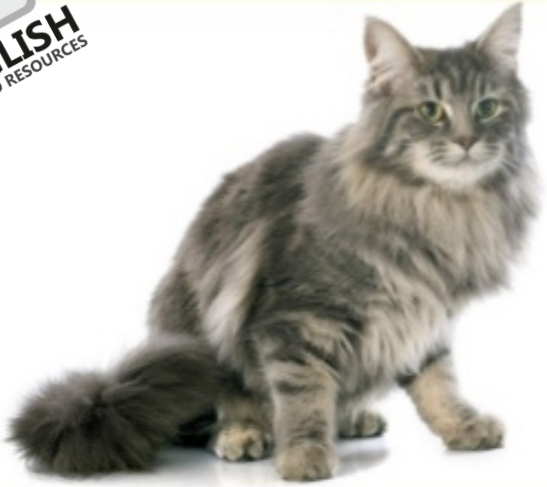
c a t