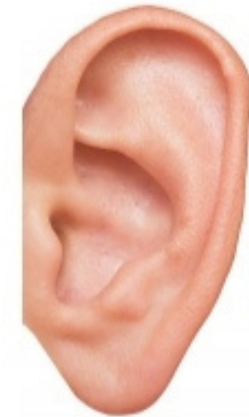
e a r