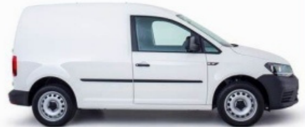
v a n