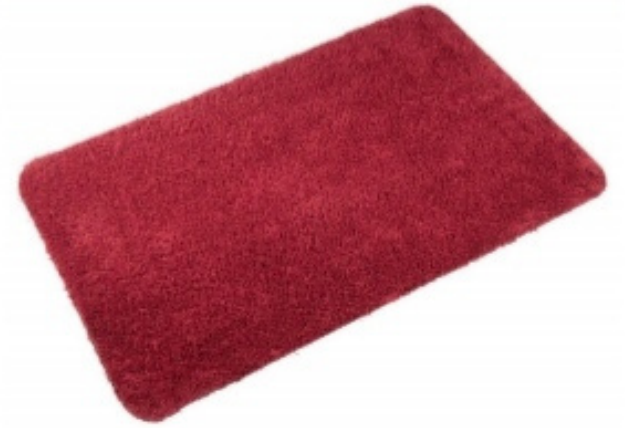
m a t