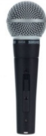
m i c