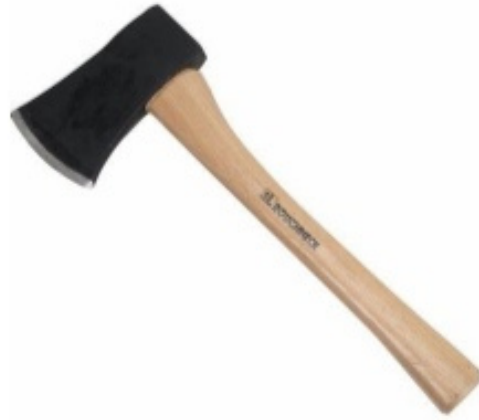
a x e